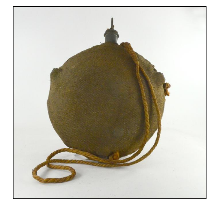
M1858 Smoothside canteen